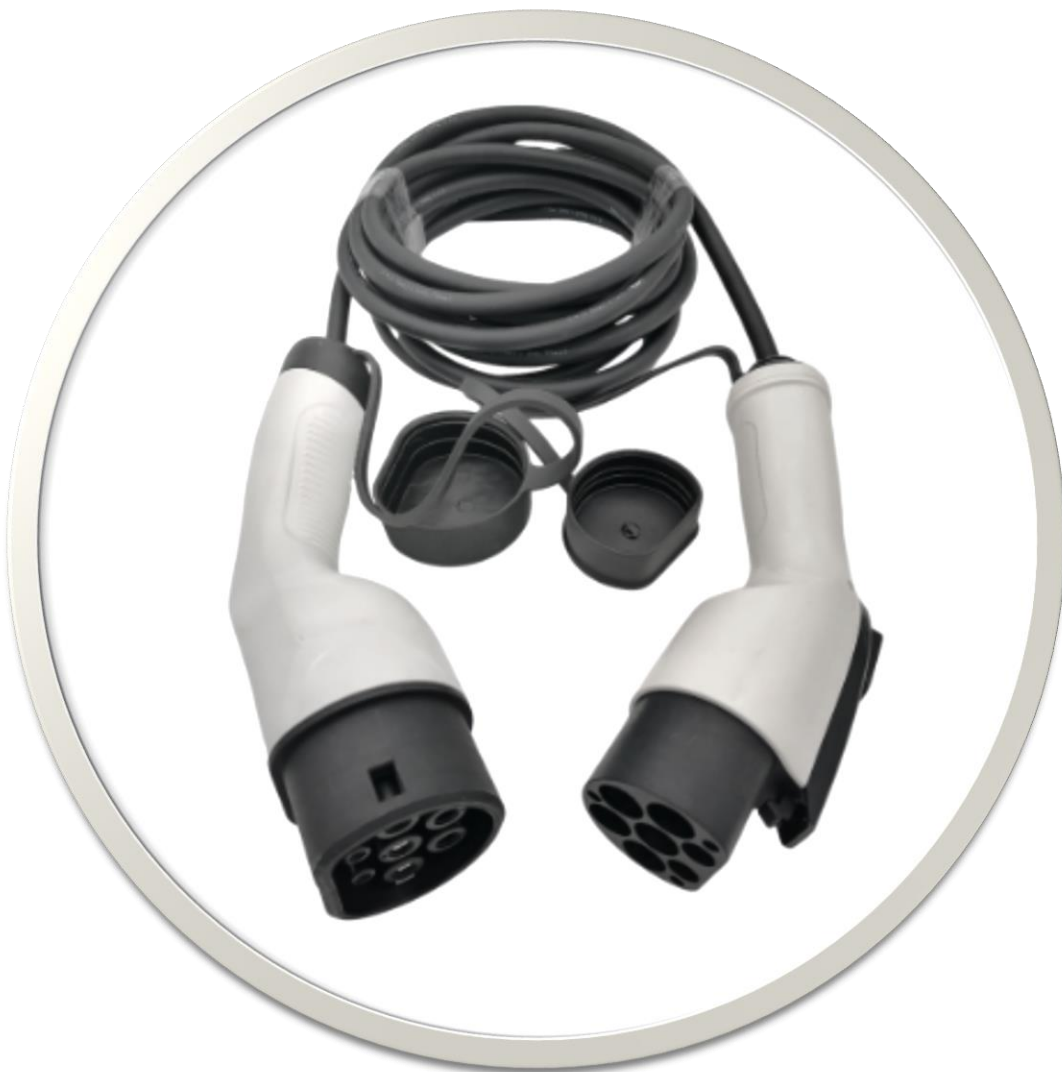
HLK-620 URL Download