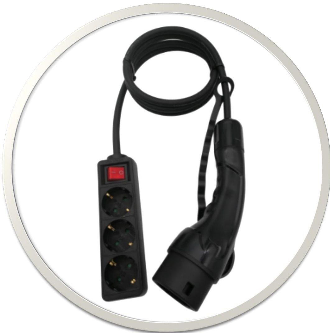
HLK-618 URL Download