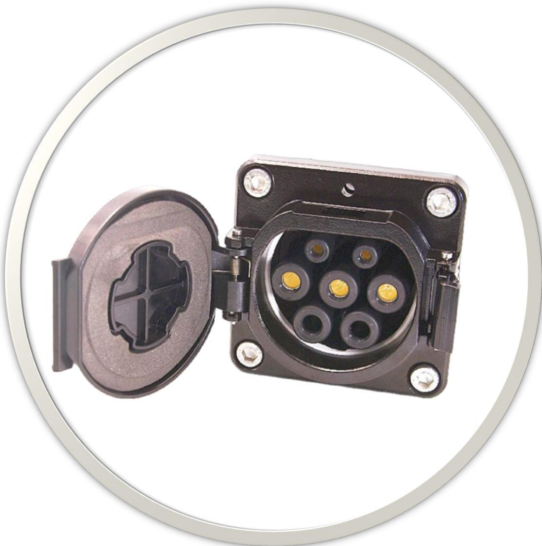
HLK-602 URL Download