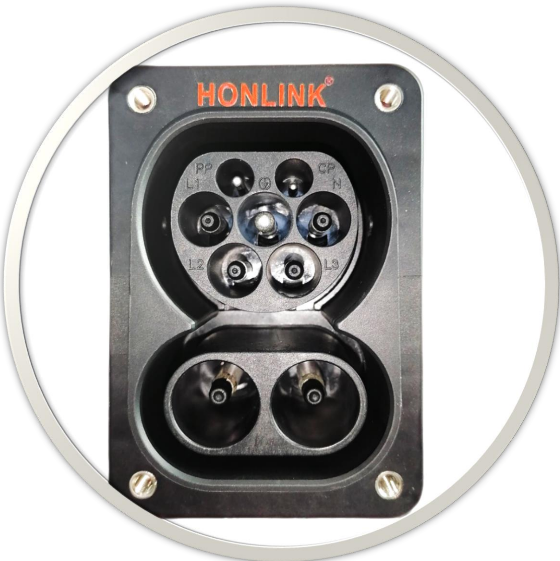
HLK-610 URL Download