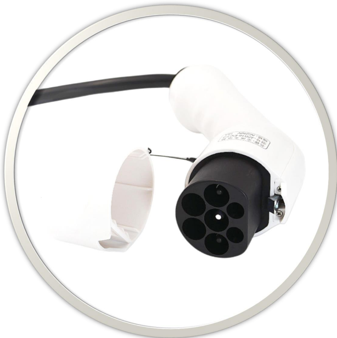
HLK-601 URL Download