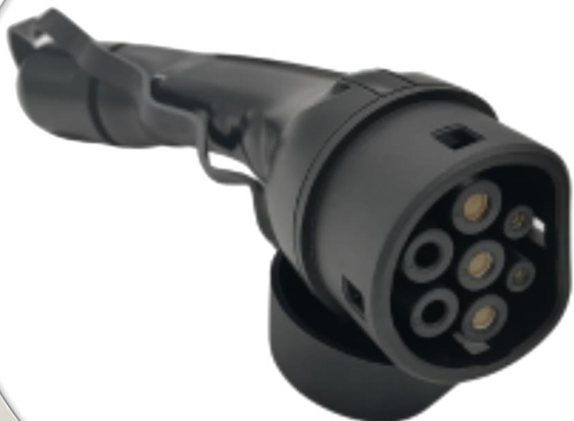
HLK-603 URL Download