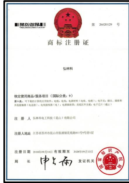
Chinese/English Trademark Certificate