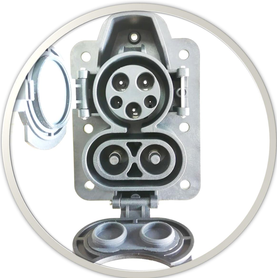
HLK-612 URL Download