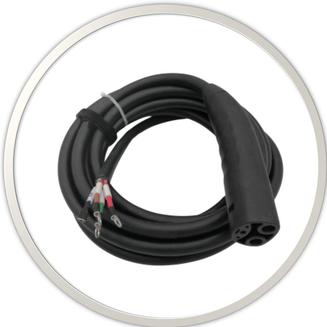
HLK-611-1 URL Download