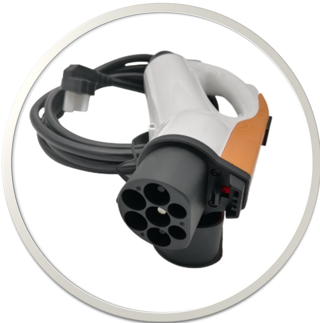
HLK-621 Pro URL Download