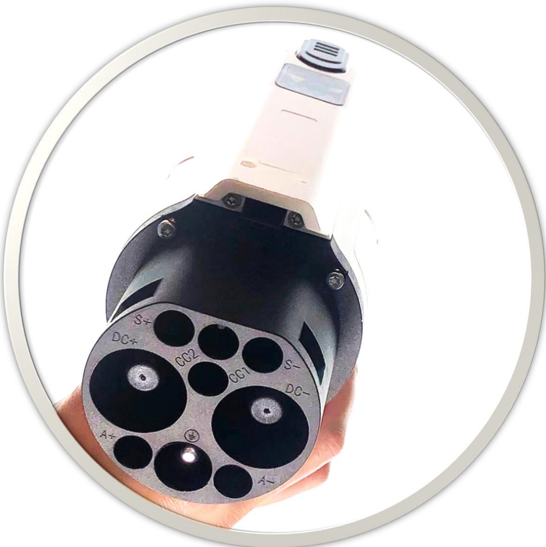
HLK-607 URL Download