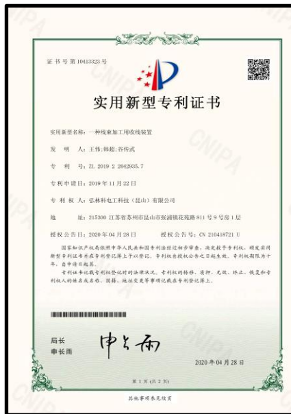
More than 20 Patent Certificates in China 5