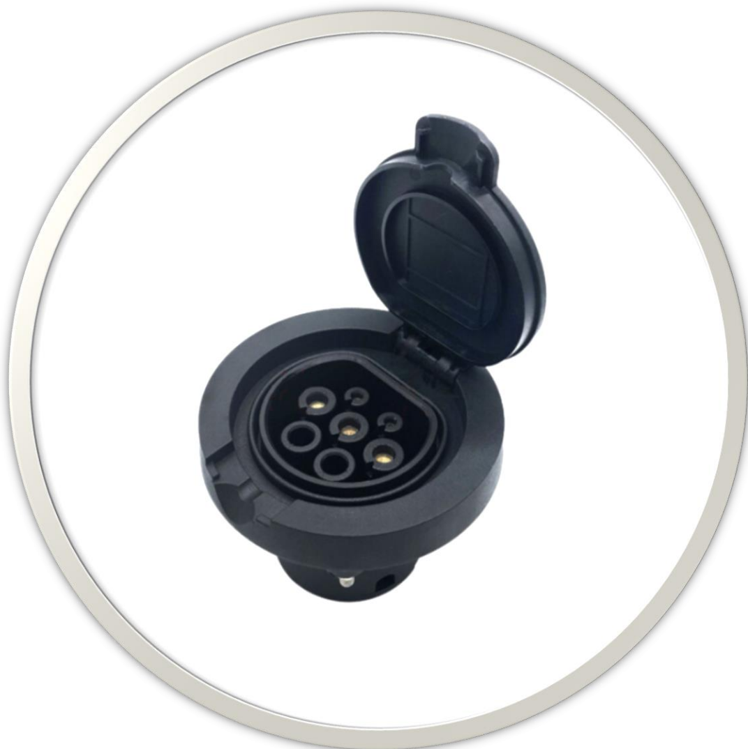
HLK-604-2 URL Download