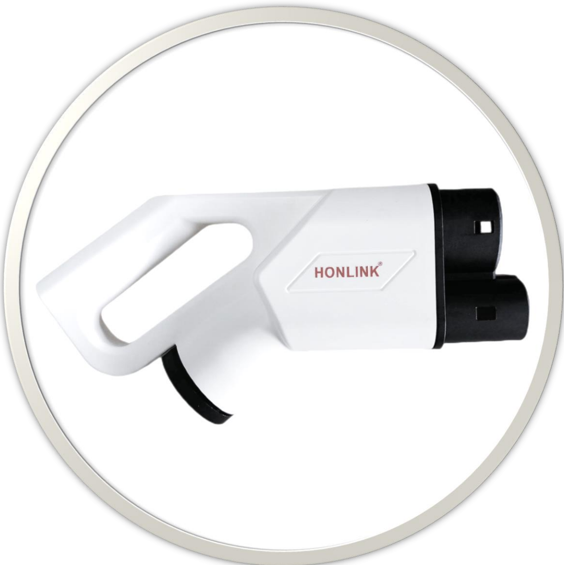
HLK-609 URL Download