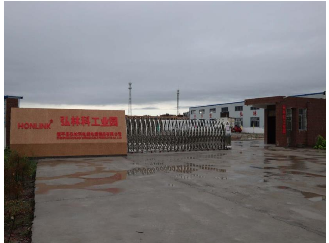
HE HAN Factory