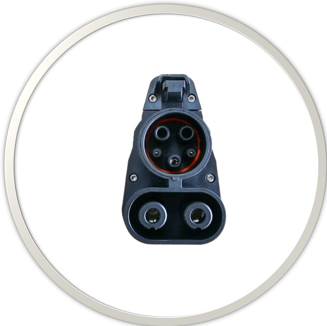
HLK-611 URL Download