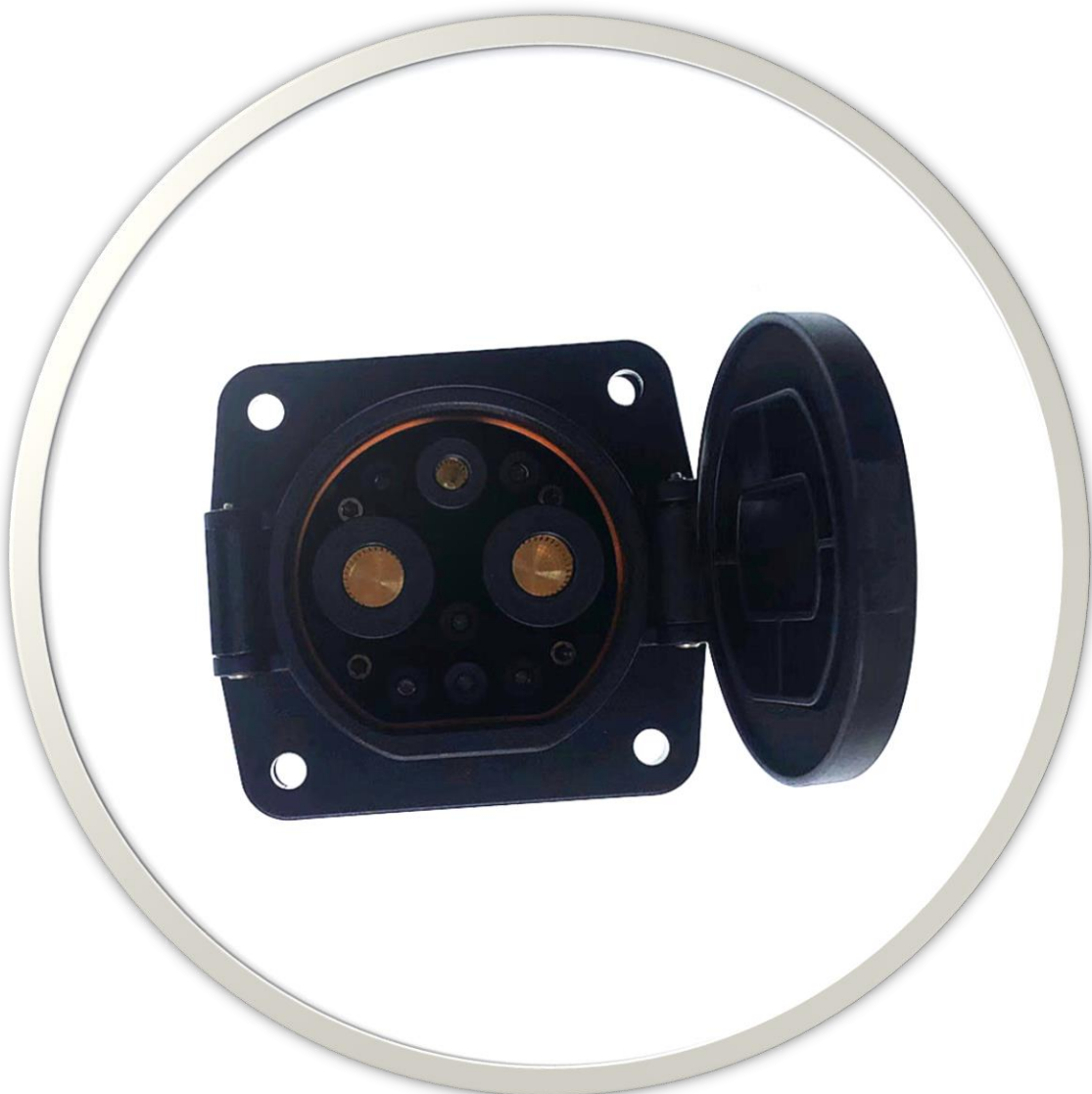
HLK-608 URL Download