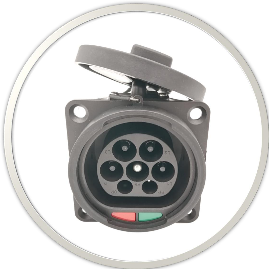
HLK-604-3 URL Download