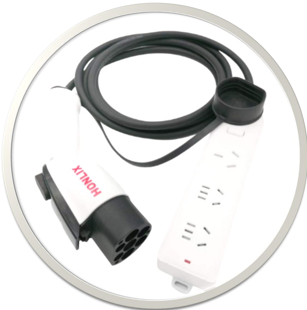
HLK-617 URL Download