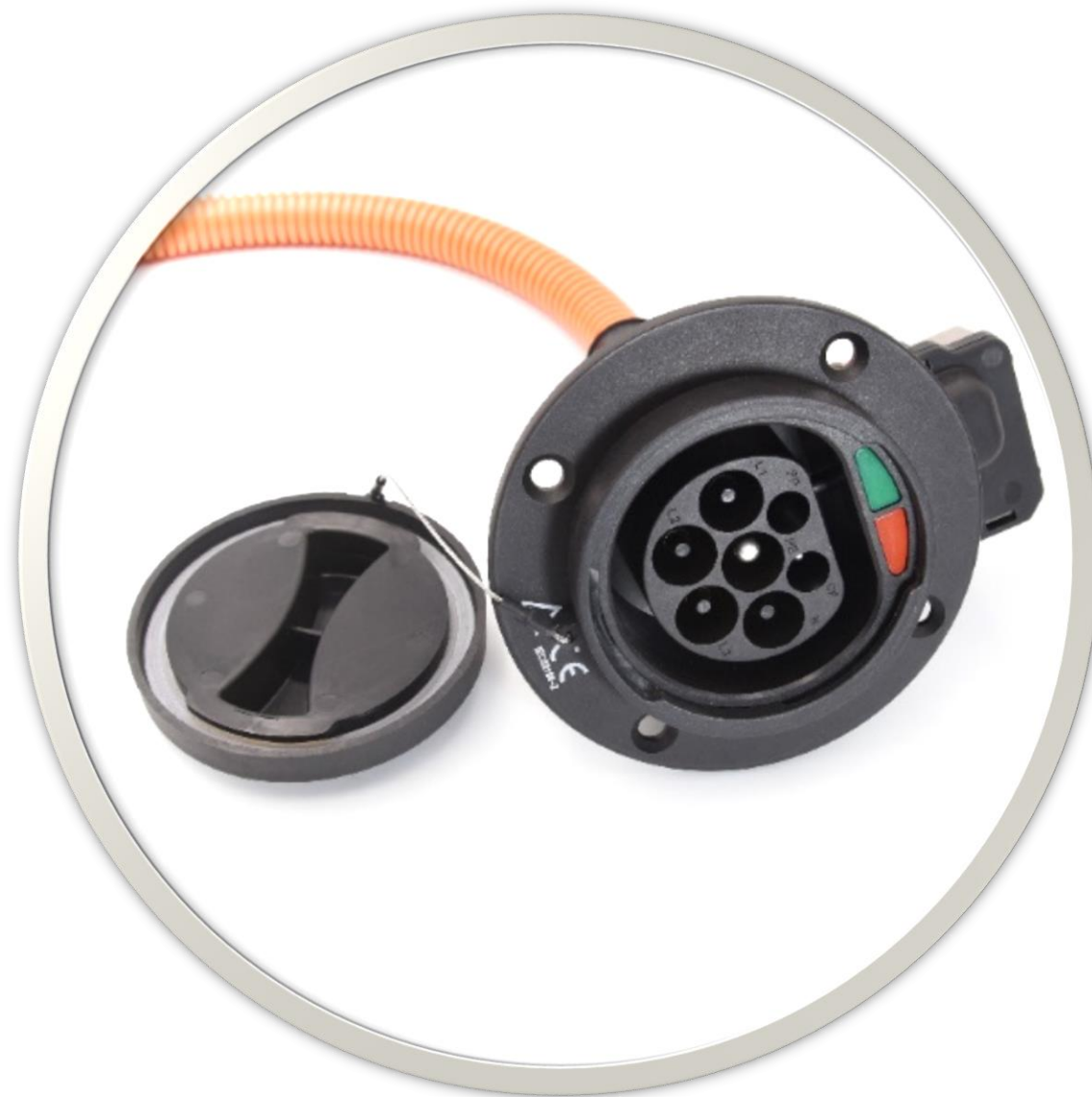
HLK-604 URL Download