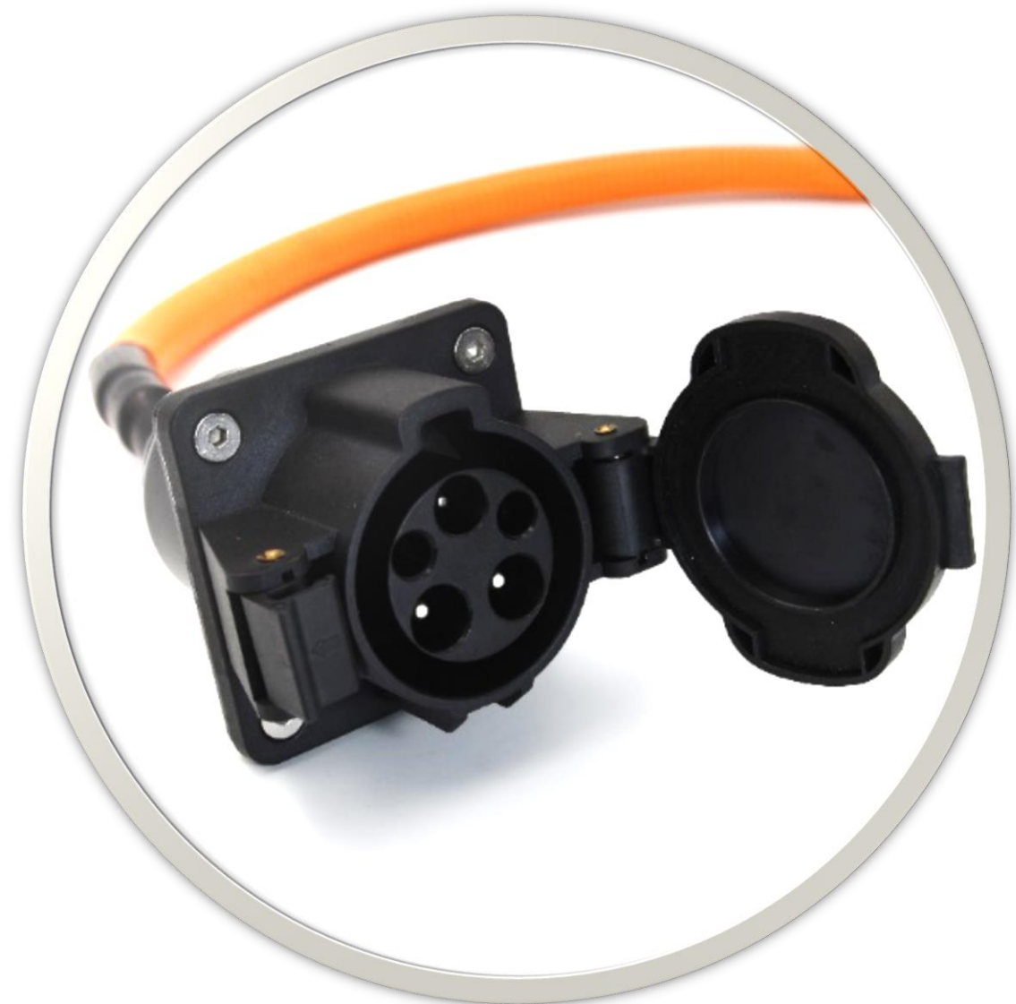
HLK-606 URL Download