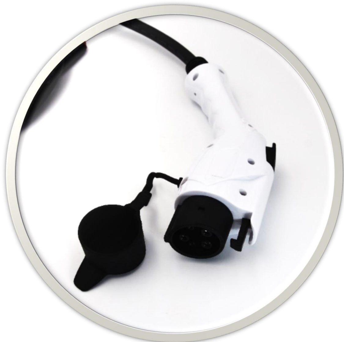
HLK-605 URL Download