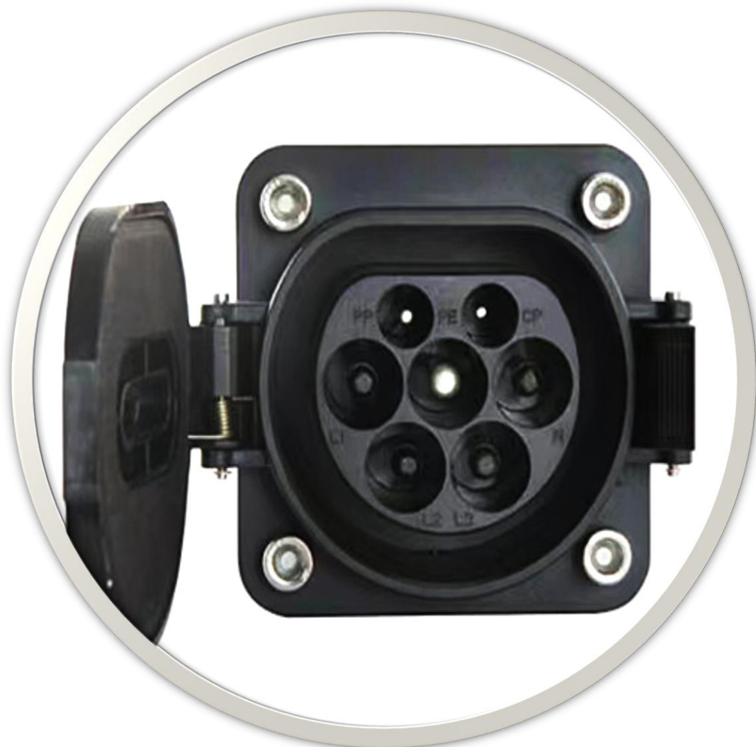
HLK-604-1 URL Download