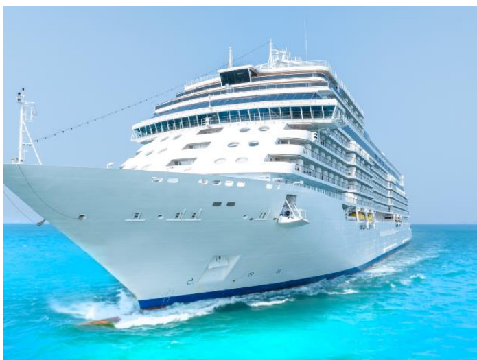
船舶应用 Ship applications