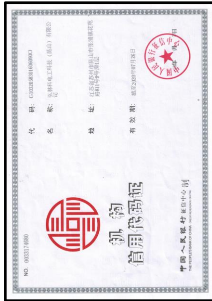
Letter of Credit