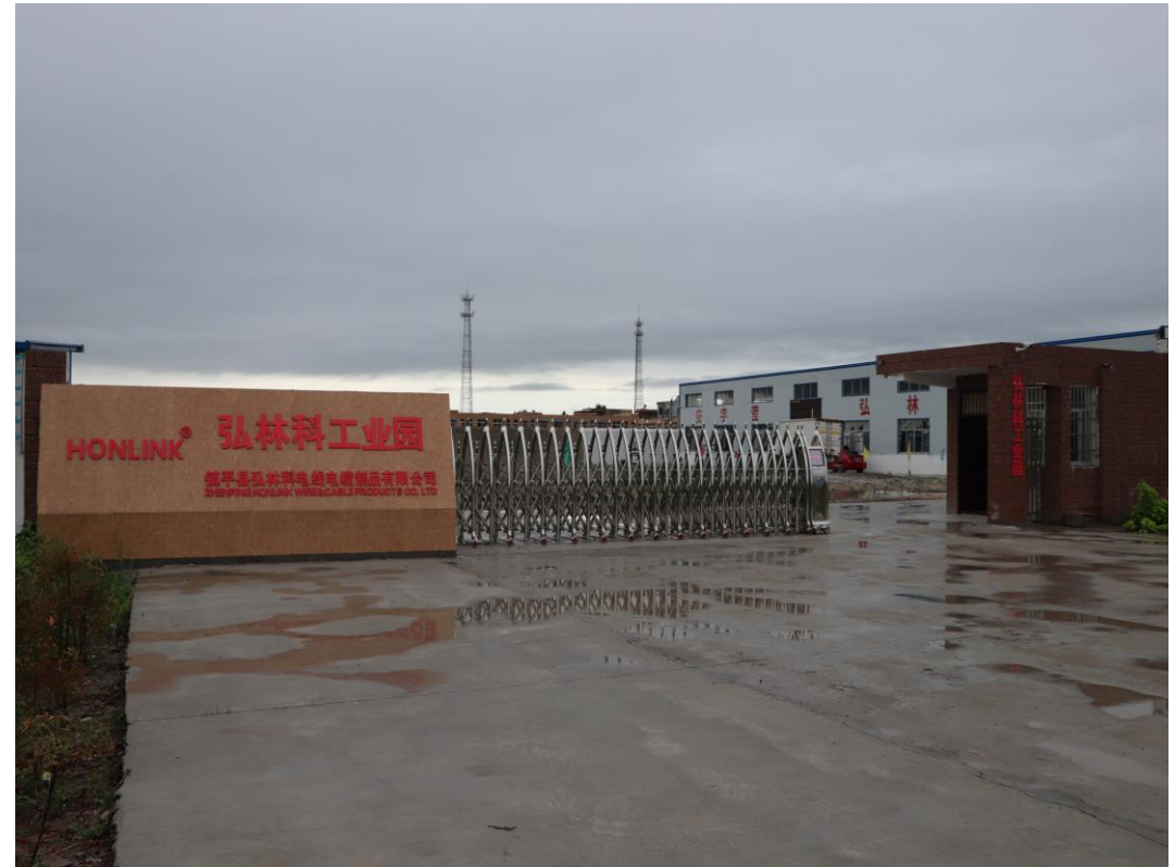
HE HAN Factory