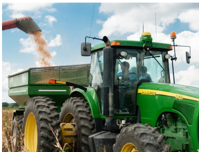
农业机械 Agricultural Machinery