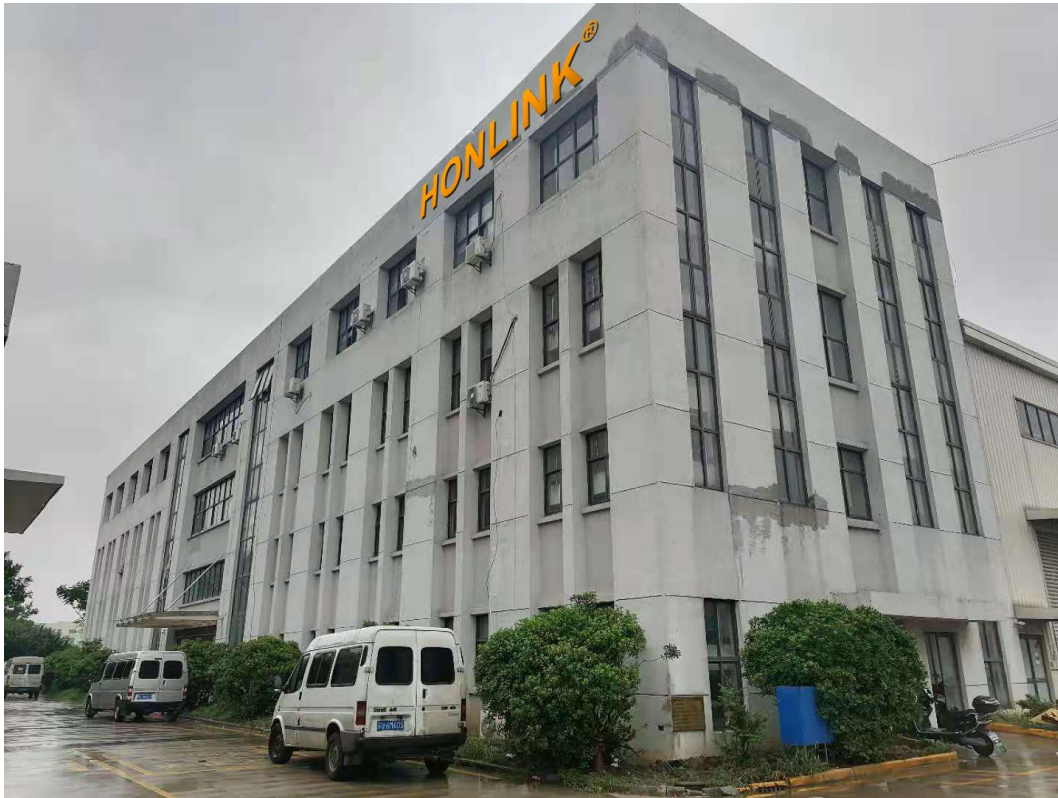
KUN SHAN Factory