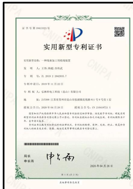
More than 20 Patent Certificates in China