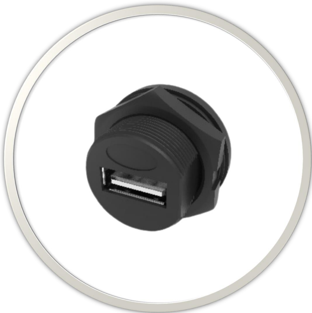
USB 2.0 PCB式 Customized Products