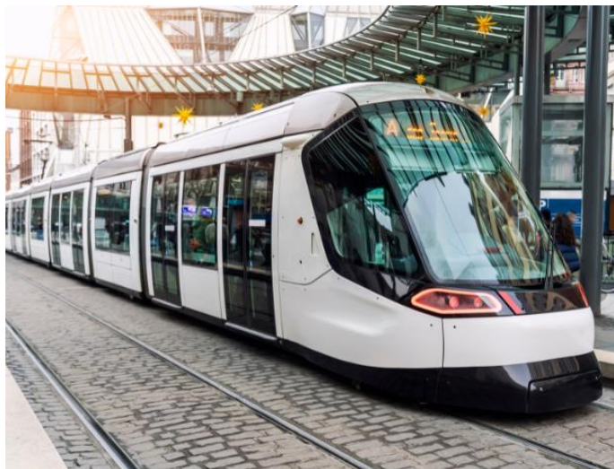
轨道交通 Rail Transit