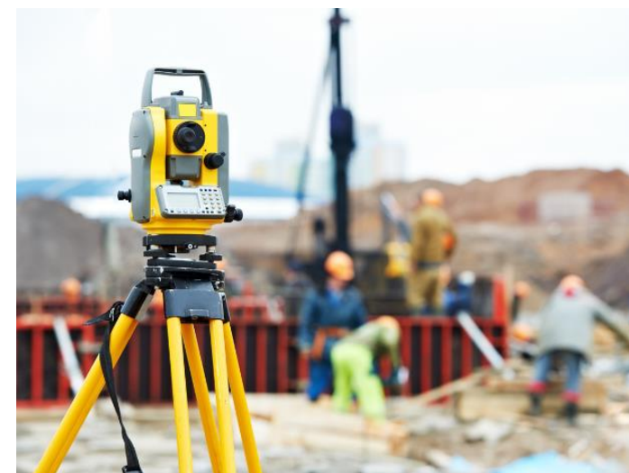
测试设备 Test equipment